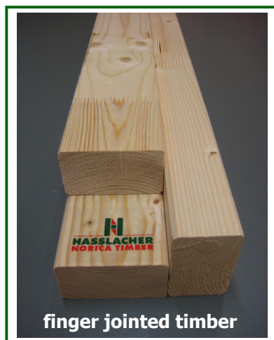
finger jointed timber